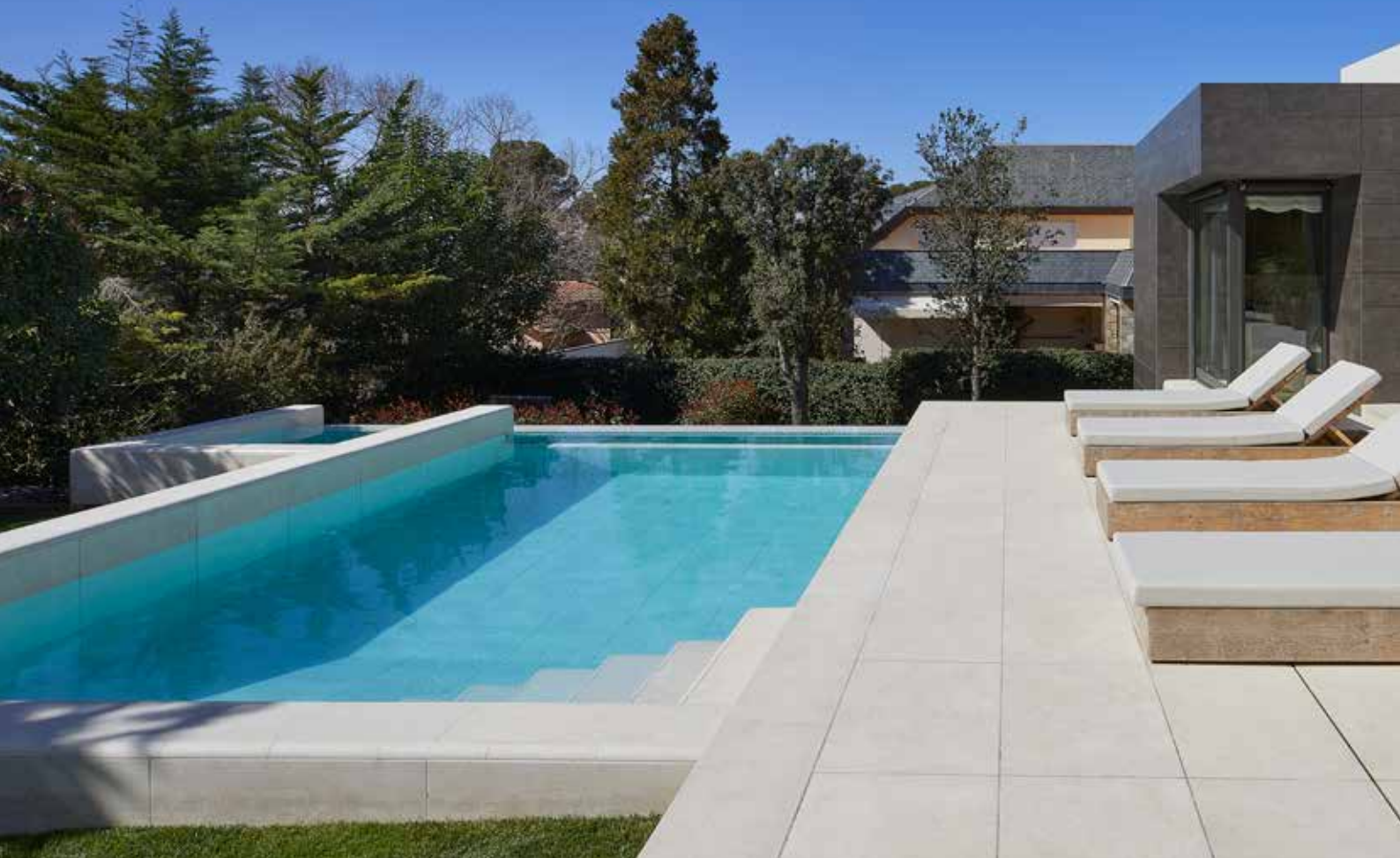
Cover, page 3 and back cover: Private pool, Mistery White. Architect, Josep Aurell, GAAB Arquitectes