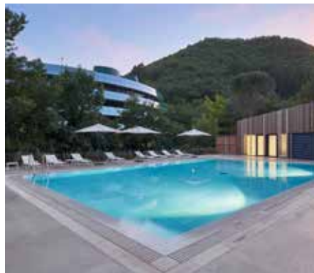
Eau thermale Avène l'hôtel France