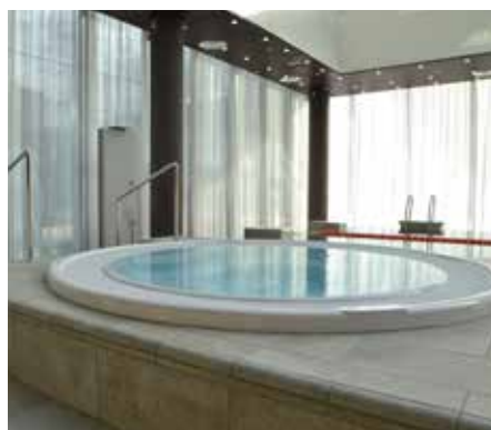
Spa Hotel Hilton Saint Petersburg, Russia Arch: KSK - STROY