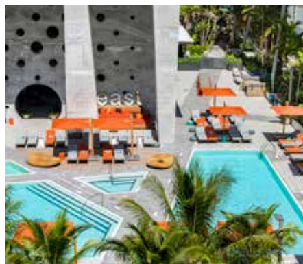
EAST Miami, USA Arch: Arquitectonica